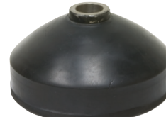
205 5" Dia.