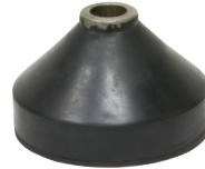
204 4" Dia.