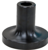
300-802 3" Steel 802 Taper