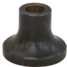
200-802 2" Steel 802 Taper