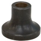
200-802 2" Steel 802 Taper