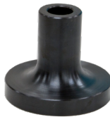
300-802 3" Steel 802 Taper