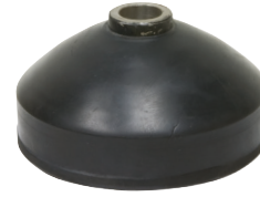
205 5" Dia.