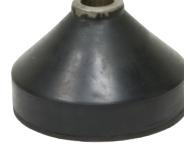
204 4" Dia.