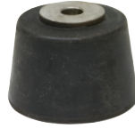
203 3-1/4" Dia.